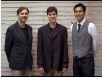
Quick Center plans tribute to jazz great Bill Evans