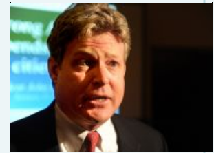
Ted Kennedy Jr. to run for state Senate