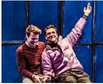
The Homosexuals Theater Mania