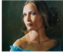
Oil Painting Portraits Made Easy Learnist