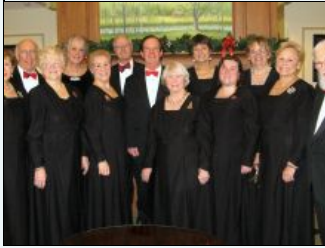
'Live, Love, Laugh' in Danbury