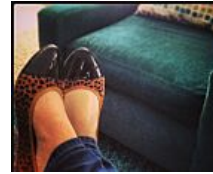
Cocorose London: Ballet Flats for Travel The Vacation Gals