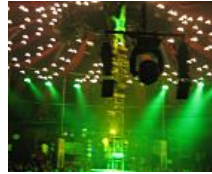
Show Stoppers In Vegas AFAR